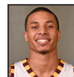
25 FERGUSON Jr. ▶ Forward

MIN. 18.8 PPG 6.8 RPG 1.3 APG 1.3 FG% 42.8 3FG% 37.2